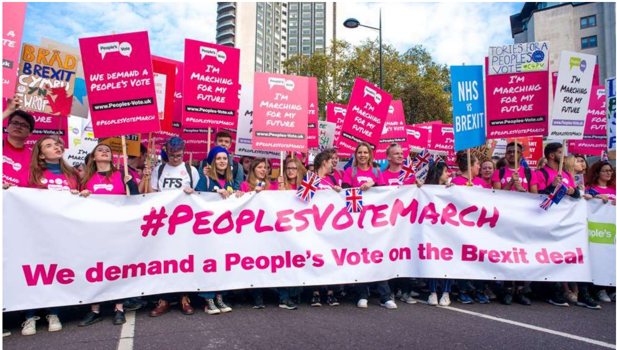
People's Vote march: '700,000' rally for new Brexit referendum, The Guardian , 21 October 2018